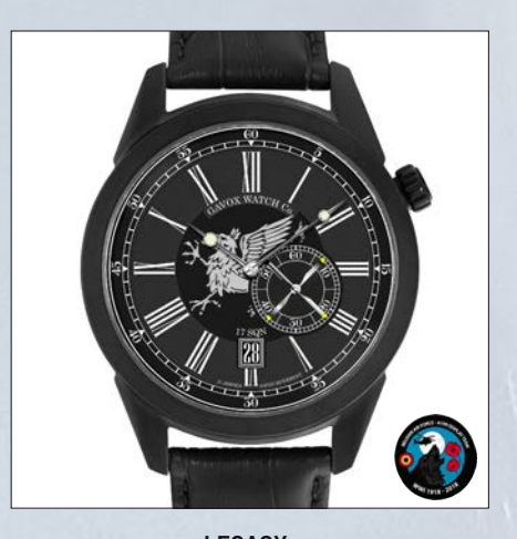
LEGACY BAF 17 SQN