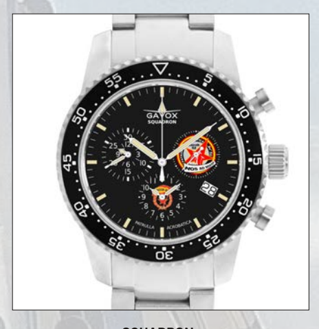
SQUADRON SPAIN JACOB 52