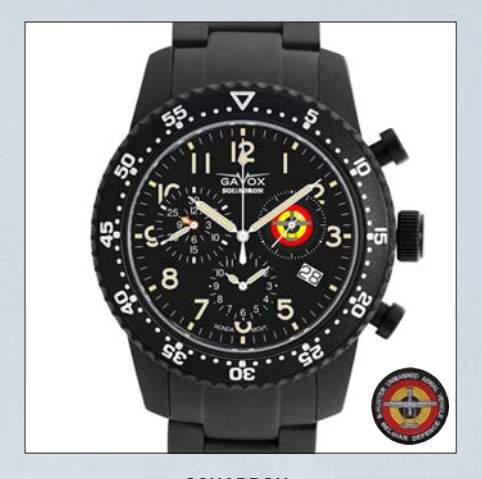
SQUADRON BAF 80 SQN