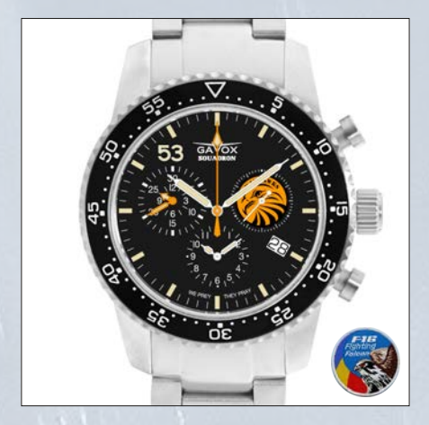
SQUADRON ROMANIAN AIR FORCE 53 SQN