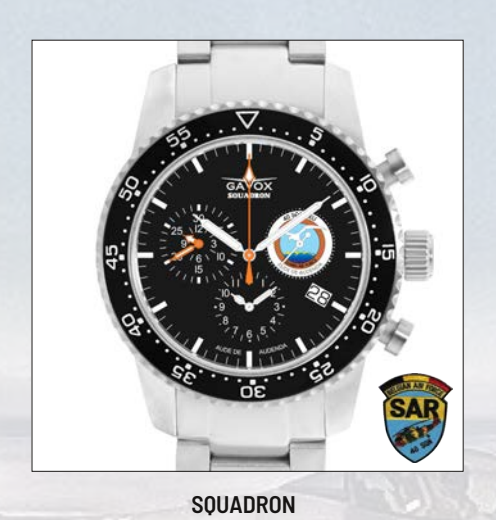
BAF 40 SQN SAR