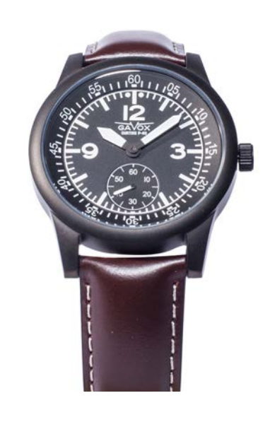
CURTISS P-40 REF 326.1

SEIKO INSTRUMENTS VD78, BRUSHED STAINLESS STEEL CASE, CANVAS STRAP WATER-RESISTANT 50M/165FT