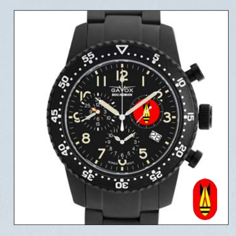
SQUADRON RE SEDEE-DOVO