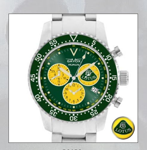
ROADS OTUS: HOUSE OF SPEE