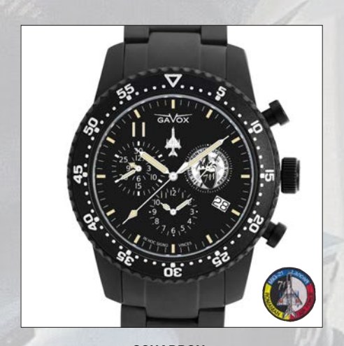
SQUADRON ROMANIAN AIR FORCE 711 SON