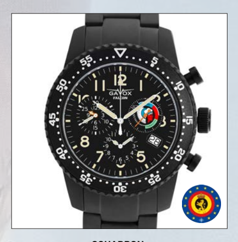
SQUADRON BAF 15 WING