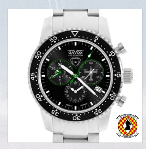
SQUADRON USN HMM-264