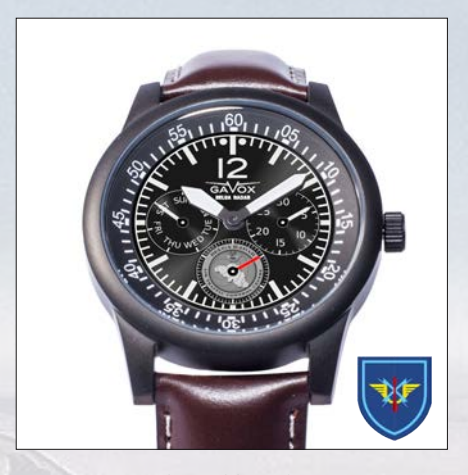
CURTISS P-40 BAF ATCC