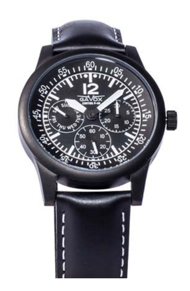
CURTISS P-40 REF 350.1

SEIKO INSTRUMENTS VD78, BRUSHED STAINLESS STEEL CASE, CANVAS STRAP WATER-RESISTANT 50M/165FT