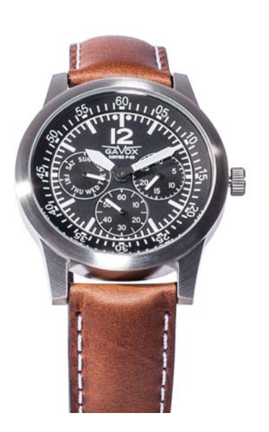
CURTISS P-40 REF 350.0

SEIKO INSTRUMENTS VD78, BRUSHED STAINLESS STEEL CASE, CANVAS STRAP WATER-RESISTANT 50M/165FT