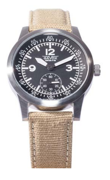
CURTISS P-40 REF 326.0

SEIKO INSTRUMENTS VD78, BRUSHED STAINLESS STEEL CASE, CANVAS STRAP WATER-RESISTANT 50M/165FT