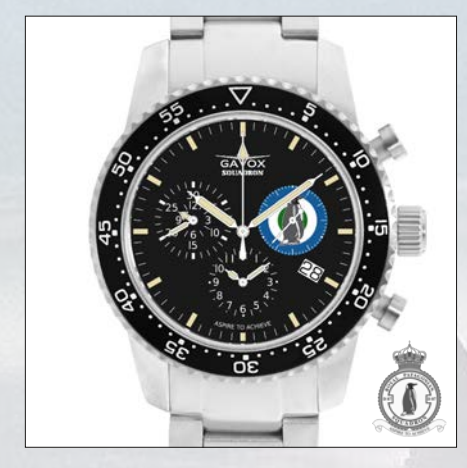
SQUADRON ROYAL PATAGONIA